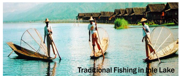
Traditional Fishing in Inle Lake