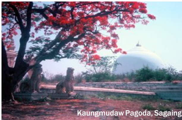
Kaungmudaw Pagoda, Sagaing

wooden bridge. After check-in hotel, start Mandalay full day sightseeing tour includes Mahamuni Image - a bronze Buddha image casted during the lifetime of Buddha himself; Tapestry Works; Wood Carving & Bronze Casting Workshops; Marble Carving Workshop; Gold Leaf Beating Workshop; and Silk Weaving Home Cottage. Lunch at local restaurant. Continue visit to: Mandalay Palace, Shwenandaw Monastery - noted for its exquisite wood carvings; Atumashi Monastery; Kuthodaw Pagoda - known as the world biggest book; and finish the tour by visiting Mandalay Hill to watch the sunset and the panoramic view of the city. Dinner at a local restaurant. Overnight at hotel in Mandalay.