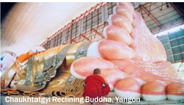
Chaukhtatgyi Reclining Buddha, Yangon

Arrive at Yangon Airport by flight. Welcome by a tour guide and transfer to Hotel. Lunch at local restaurant. After lunch, visit to Chauk Htat Kyi - a colossal reclining Buddha, Yangon City Center surrounded by various colonial style buildings of World War II & Independent Monument for photo shooting & witness the daily life of local people. Early evening visit to the world famous golden stupa, Shwedagon Pagoda - the golden dome rises 98 meters above its base and is covered with 60 tons of pure gold. Dinner with cultural show at Karaweik Palace - a famous floating restaurant located on the Royal Lake built in the style of Royal Barge used by Myanmar's old days kings. Overnight at hotel.