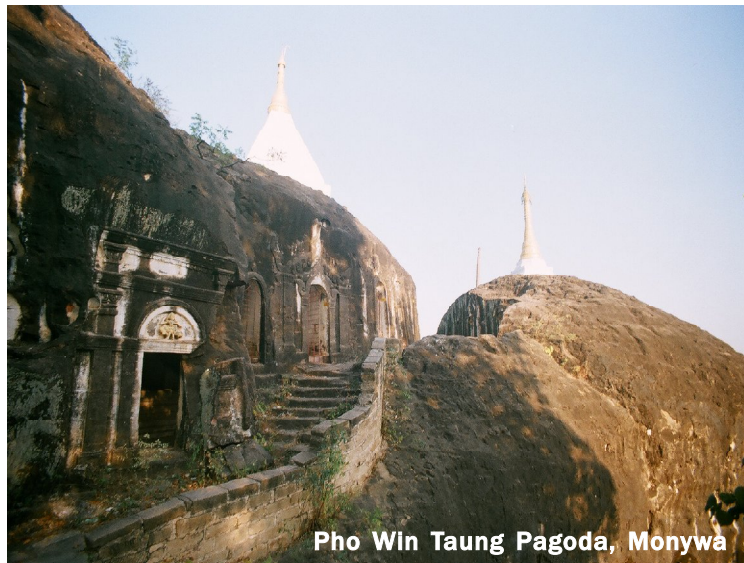
Pho Win Taung Pagoda, Monywa

After breakfast at hotel, drive to Monywa, a busy trading cities of the upper Myanmar, about (150 km-4hrs) to the west of Mandalay and a commercial center of Chindwin Valley. Then