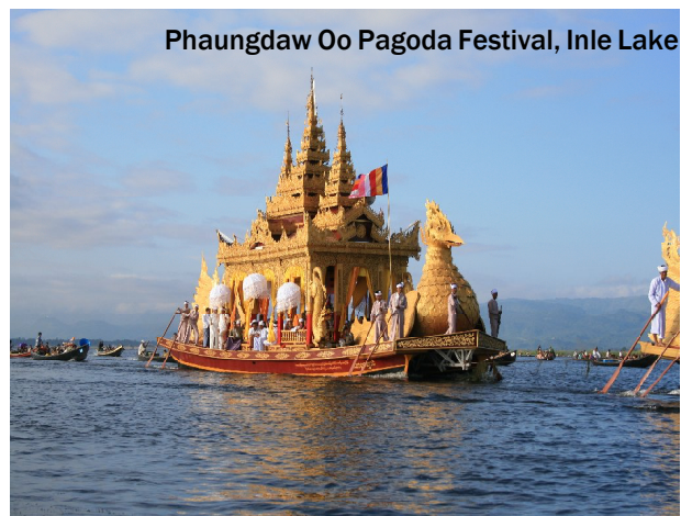
Phaungdaw Oo Pagoda Festival, Inle Lake

market days only which is hold on every five days), Ngaphechaung Monastery, one of the oldest monasteries on the lake and well know for its jumping cats, floating gardens in Kay La village, famous wish-fulfilling Phaungdaw Oo Pagoda, Inpawkhone Village - famous for its silk weaving handloom; blacksmith shop at Se' Kaung village and traditional cigar making (Cheroot Factory). Lunch at the local restaurant.