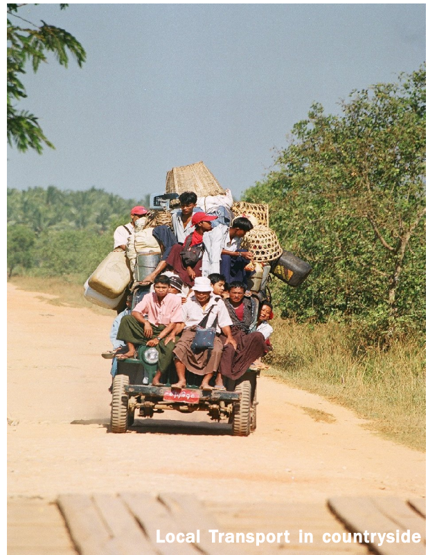
Local Transport In countryside

(Remarks: Our tourist vans or coaches can only reach to the base camp named Kimpun Camp. From Kimpun Camp to Yathetaung middle camp, all the visitors have to take the local trucks for the safety purpose. Our price for the small groups from 1 to 15 people, we only calculated base on the normal joining cost with other passengers. If you need a private transport truck, we will arrange it and additional charges applied are payable by client. Please see detail extra costs. )