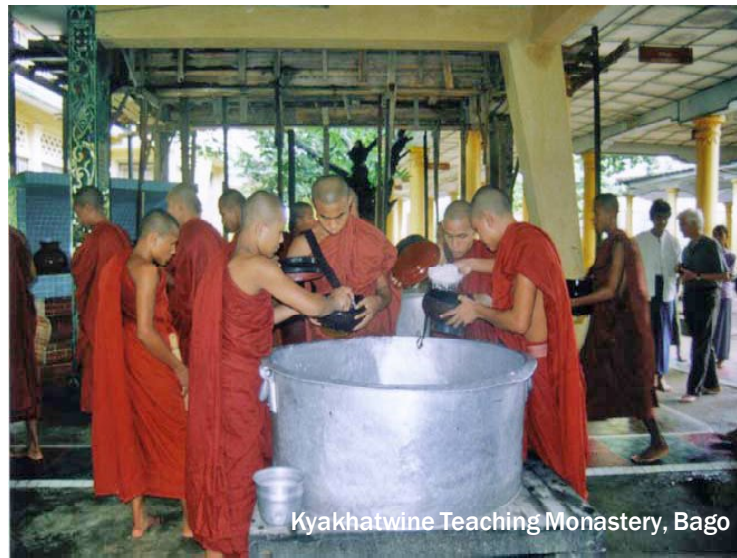
Kyakhawine Teaching Monastery, Bago

Arrive at Yangon International Airport. Meet and transfer to Hotel to check in. Lunch at a local restaurant. After lunch, start orientation tour of Yangon visiting Yangon City Centre surrounded by various colonial style buildings of War World II & Independent Monument for photo shots & witness the daily life of local people; Chaukhtatgyi Pagoda - a colossal reclining Buddha, and end of the tour at Shwedagon Pagoda - over 2500 years old the world famous stupa. Welcoming Dinner with cultural show at Karaweik Palace, built in the style of Myanmar old days king's Royal Budge. Your first night is in Yangon.