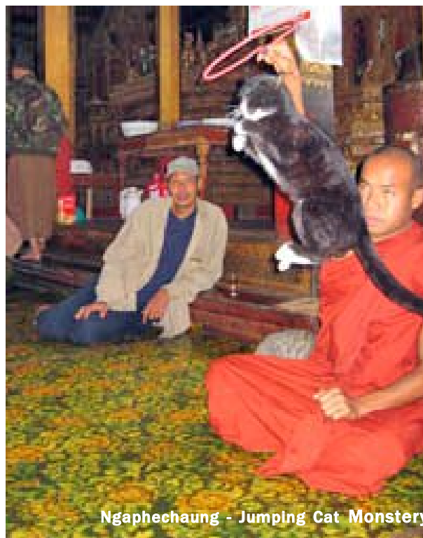
Ngaphechaung - Jumping Cat Monastery

After breakfast at the Hotel, visit to Amarapura, an ancient capital built by the advice of astrologers and U Bein Bridge - 1.2 km long over 200 years old wooden bridge; Mahagandaryone Monastery, where one may observe the daily life of the monks studying Buddha's scriptures and Silk weaving home cottage. Lunch at the local restaurant and