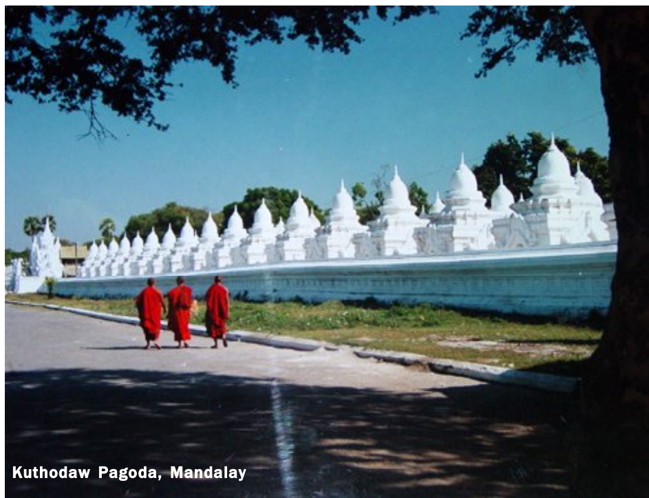
Kuthodaw Pagoda, Mandalay

After breakfast at the hotel, visit to Mingun where the world largest ringing bell exist. Sightseeing Pahtodawgyi unfinished Pagoda, Mingun Bell, Myatheindan Pagoda, Home for the aged and environs scene. Lunch at local